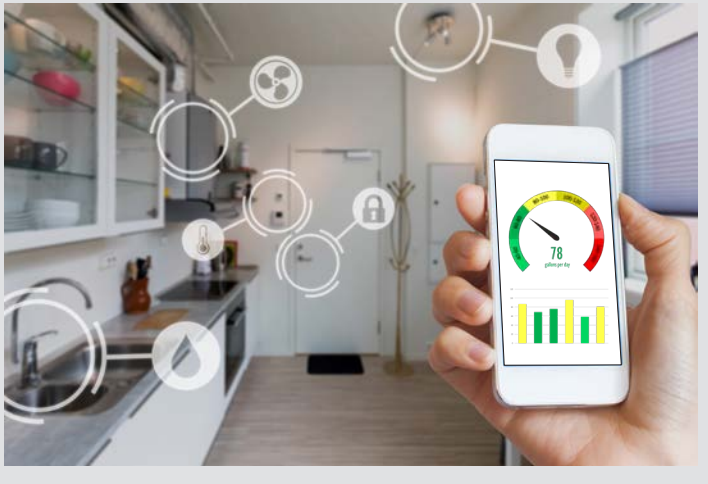
Dispense specific quantities & track water usage