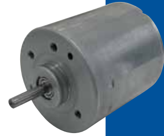
■ 3 Phase 4 holes inner rotor type DC Brushless Motor