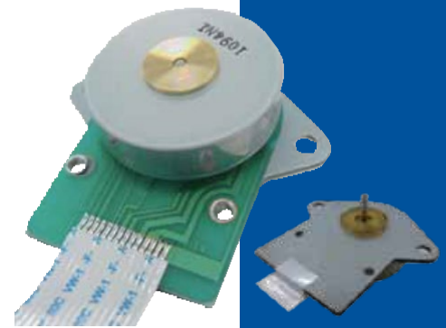
■ 3 Phase outer rotor type DC Brushless Motor